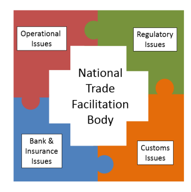
Figure 1 . A number of issues in international trade can be challenging for the trading community. A National Trade Facilitation Body can help bring these issues together in a coherent way.