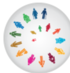
Population and Development