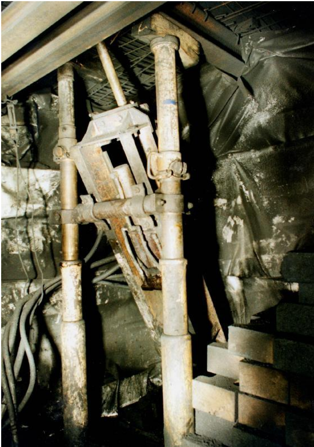
Figure 3. Cross-measure drilling rig