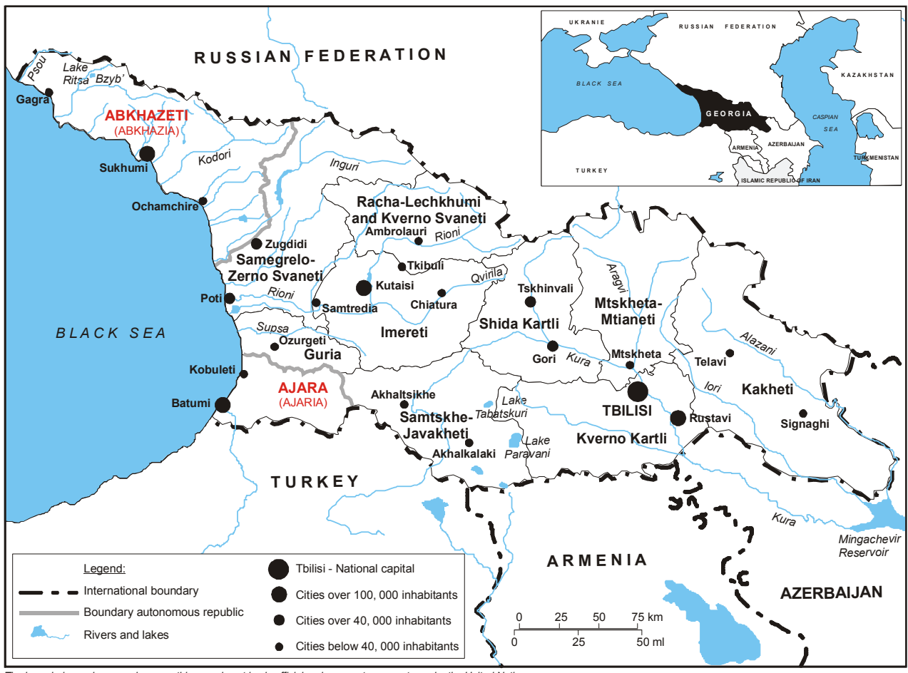
Figure 1.1. Map of Georgia

The boundaries and names shown on this map do not imply official endorsement or acceptance by the United Nations