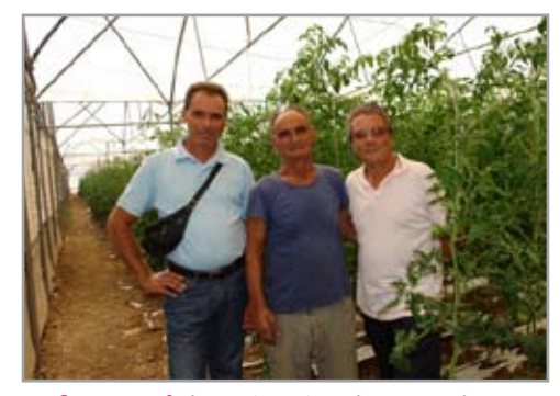
Growers of cherry tomatoes in a greenhouse outside Ispica

Exported products are often rejected for reasons unrelated to their intrinsic quality, such as marking, sizing, careless picking and handling, minor skin defects that result in rotting during long-distance transportation. Almost no additional investment is needed for