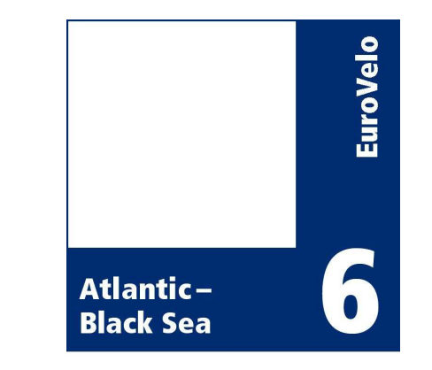
C. Technical information