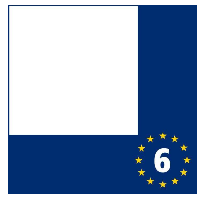
Standard version with stars