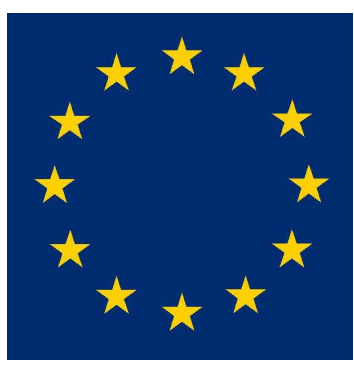
Pantone: yellow Cmyk: 0/0/100/0 RGB: 255/204/0 www: FFCC00