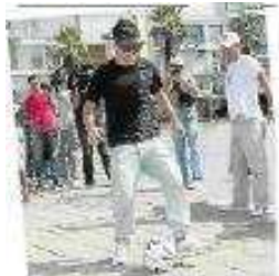
Standa gelen vatandaşlar "sarıhoş gözlüğü"nü takarak boş kaleye gol atmaya çalıştılar.