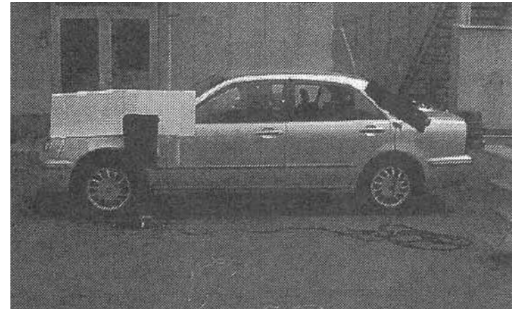
Vehicle used in this experiment