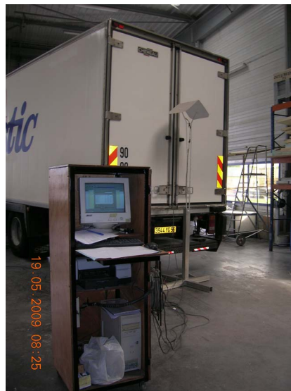
Equipment being tested for efficiency in a test centre