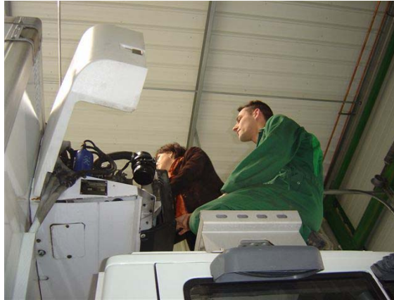
Verification of equipment by experts