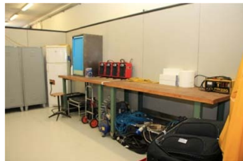
EuroMed RRU Project, Visit to the ATP Laboratory, Construction Technologies Institute of the National Research Council (ITC CNR) of Padova

Regarding the needed personnel, European experience (based on the laboratory in Padua in Italy) has shown that for the seamless operation of the Laboratory 1-2 Head Engineers are required, as well as 3-6 technicians, who will be sharing 3 8-hour shifts during a whole 24-hour day. In addition to the above, administrative personnel is needed proportionally to the needs of the Laboratory.