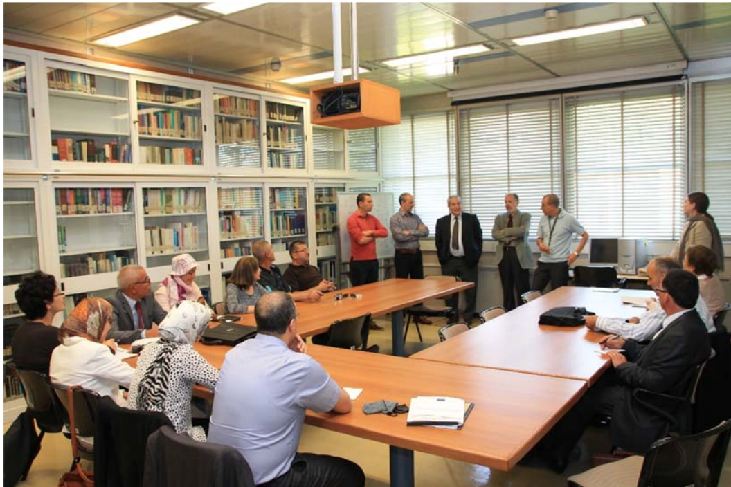
EuroMed RRU Project, Visit to the National Research Council (CNR) of Padova, Study Tour on the ATP, Padova-Vicenza-Venice, Italy, 2 – 7 June 2014, © EuroMed RRU

and better sustainability and efficiency of transport in urban areas. The 2014-2020 RTAP is currently being finalized.