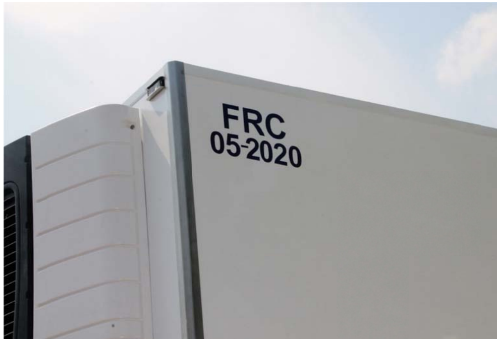
Class FRC (Class C mechanically refrigerated equipment with heavy insulation) certified equipment EuroMed RRU