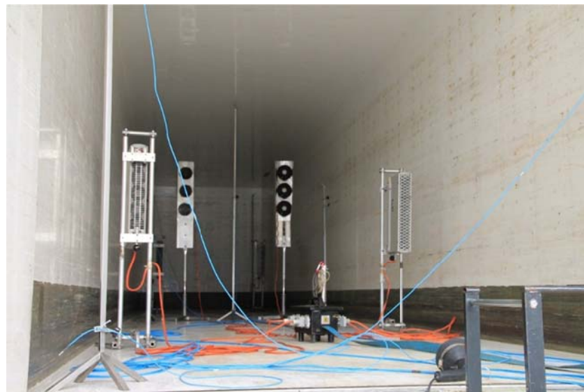
Certification tests at ITC CNR ATP Laboratory, Padova, Italy