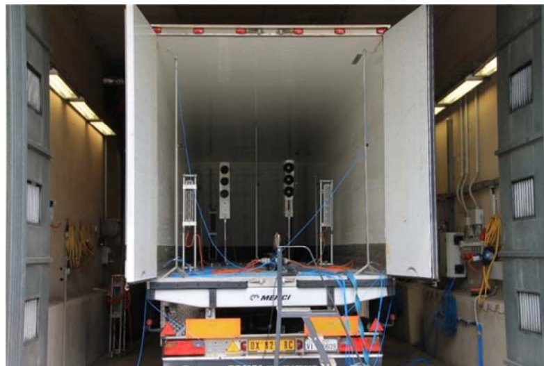
ATP Test Laboratory, EuroMed RRU Project, visit to the ATP Laboratory, Construction Technologies Institute of the National Research Council (ITC CNR) of Padova

Finally, Annexes 2 and 3 refer to the temperature conditions to be observed for the carriage of quick (deep)-frozen and frozen foodstuffs (Annex 2) and chilled foodstuffs (Annex 3) as well as the need for monitoring and recording of air temperatures for deep frozen foodstuffs.