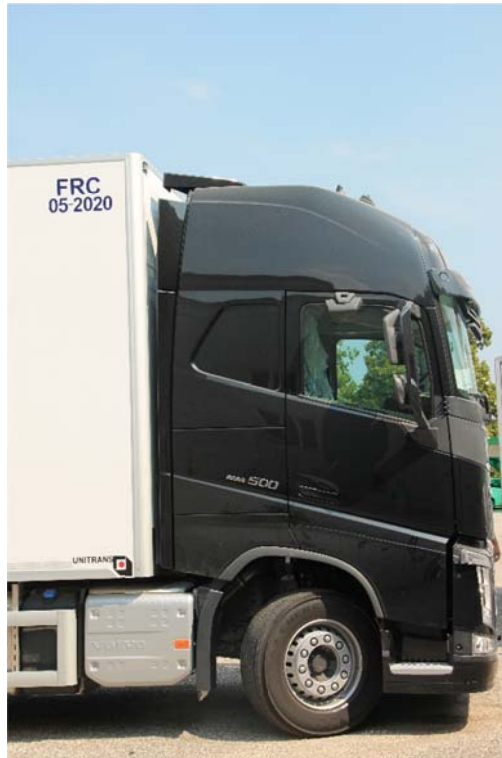
Class FRC (Class C mechanically refrigerated equipment with heavy insulation) certified equipment EuroMed RRU © EuroMed RRU

(These recommendations come from Annex 8 of the Convention on the Harmonization of Frontier Controls of Goods).