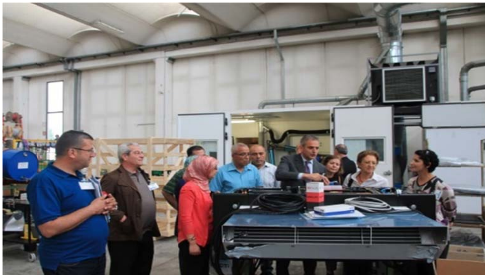
visit to Zanotti S.p.A., Constructor of refrigerating units, Pegognaga (MN) Italy