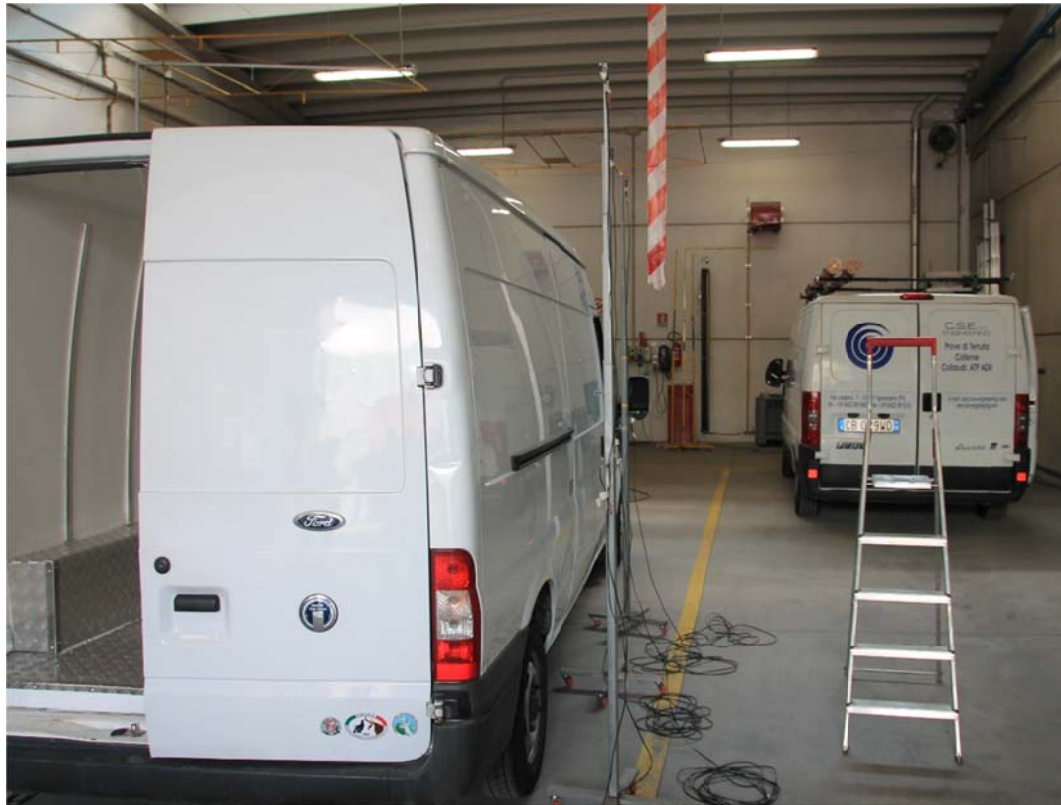
Certification tests at C.S.E. s.r.l. Engineering, ATP Expert Test Station, Padova, Italy

If the results of these tests are satisfactory, the equipment may be kept in service for a further three years, and so on.