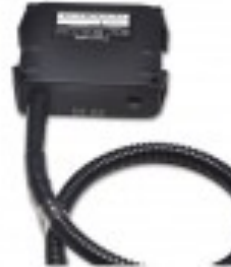
With NOx sensor