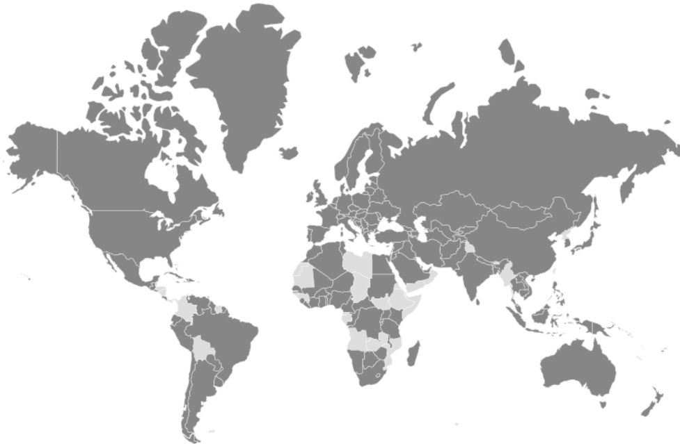
Figure III ECE and non-ECE Contracting Parties to at least one United Nations Transport Convention

Legend: Dark grey: contracting parties - Light grey: non-contracting parties