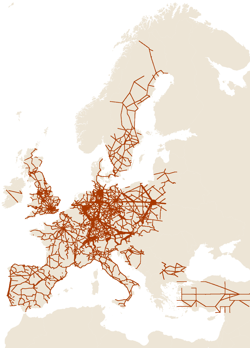
Figure 5 - The E rail network censuses: number of trains (transport of goods) (combined for 2005 and 2010)