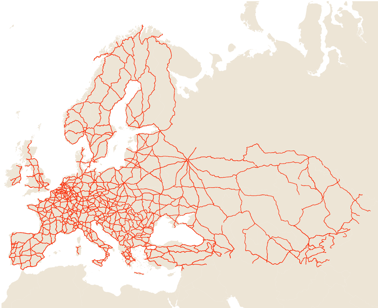
Figure 1 - The E road network