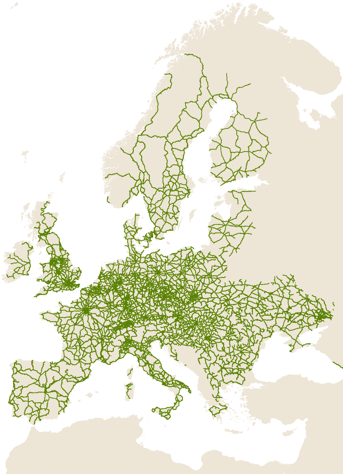
Figure 4 - The EuroGlobalMap rail network