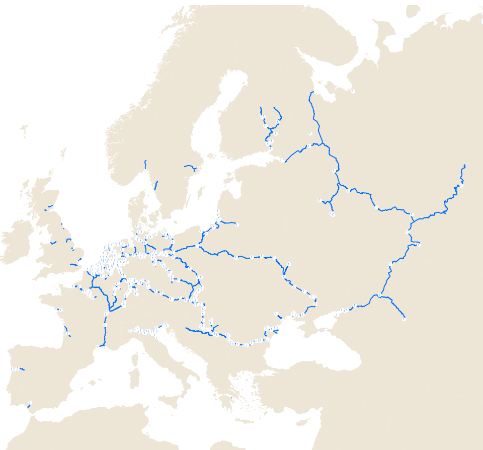
Figure 6 - The E waterways network (waterways and ports)

20. The E waterway network and ports have been put into GIS environment by UNECE (figure 6). Additional data from the UNECE Inventory of Main Standards and Parameters of the Waterway Network (Blue Book) is also included and offers an inventory of existing and envisaged standards and parameters of E-waterways and ports.