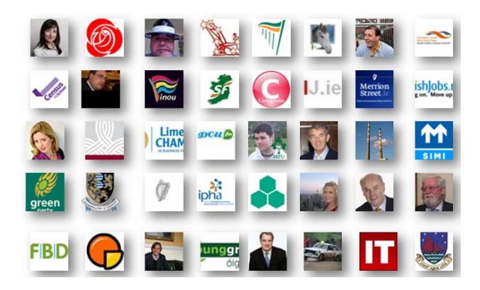
Figure 2. Followers, politicians; students; state organisation and small businesses

7. When the CSOIreland Twitter feed started in March 2010 it was hoped to achieve in the region of 250 followers. This has been well exceeded with the number in April 2011 having reached over 1,800 and continuing to rise on a daily basis. Followers range from politicians to students, from state organisation to small businesses. When compared to other similar twitter feeds, relative to populations in other countries, it rates well. The other methods of notifications to users are mailing lists (which Twitter has now well exceeded) and RSS feeds. The Releases and Publications RSS feed has in the region of 1000 visits per day so with Twitter at over 1,800 followers it has now become the main notification channel for users of CSO statistics.