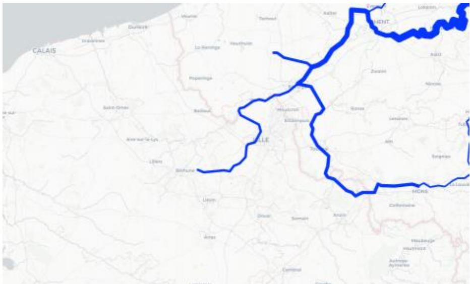
Figure 2 France Nord-Pas de Calais IWW volumes from modelled map, 2020

10. The secretariat has conducted limited order-of-magnitude checks with these sources. There are significant differences in the French data in the Nord-Pas de Calais region, with the produced map only showing volumes between Cuinchy, Lille and the Belgian border at Deûlemont (Figure 2), while the map from VNF shows significant quantities also to the sea at Dunkerque (Figure 3). This is likely due to the data quality issues listed above (although the quantities shipped in Lille appear to be similar to the national statistics, with quantities from the national source of around 5204kt at Lille compared to 5808 kt on the map.)