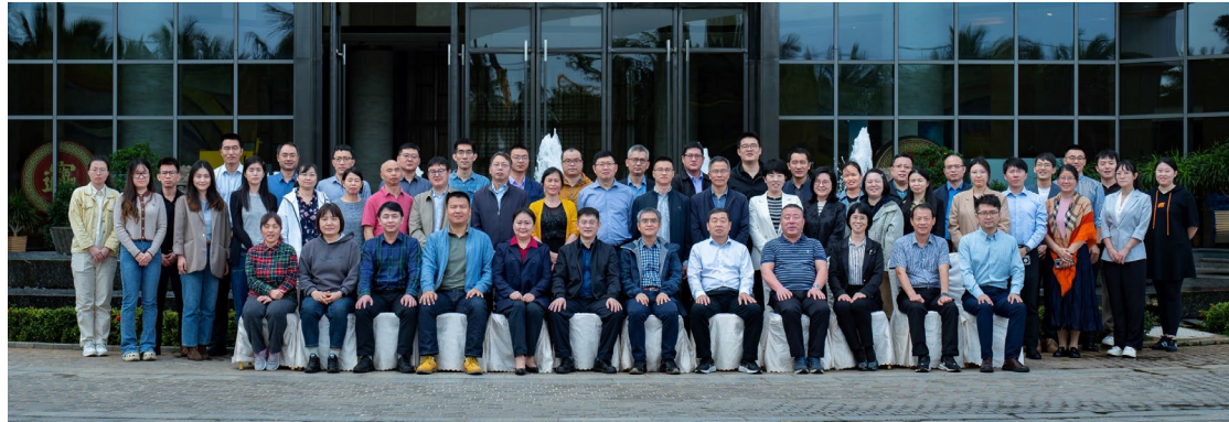
11-14 January, 2024, Hainan, China Brief Review on CNOOC Training