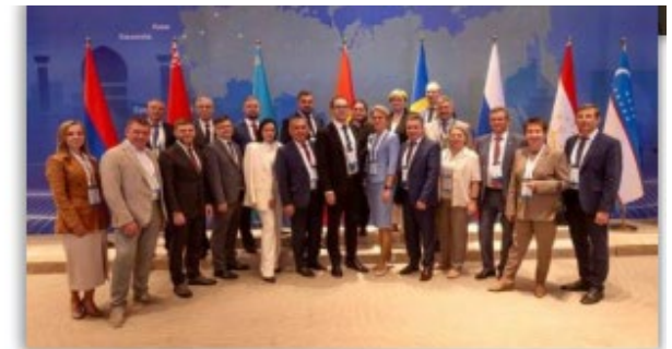
Dissemination Events ICE-SRM Russia