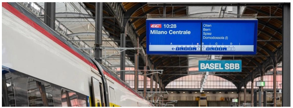
Figure 5 Effect of typography on legibility

13. Real-time train schedules and other related travel information should be readily available. This includes information on the trains' destinations and en route stops, platform details, departure times etc. Information displays or boards containing this information should be strategically placed throughout the stations or hubs and easily legible from a distance. Audio announcements, particularly in the event of service disruption, such as delays or change of platform, should be made to compliment the information provided on the information displays or boards. However, to effectively convey the information without overwhelming passengers, it is important to strike a balance between providing the necessary details and avoid overloading information in the announcement, in addition to making the announcements concise and intelligible.