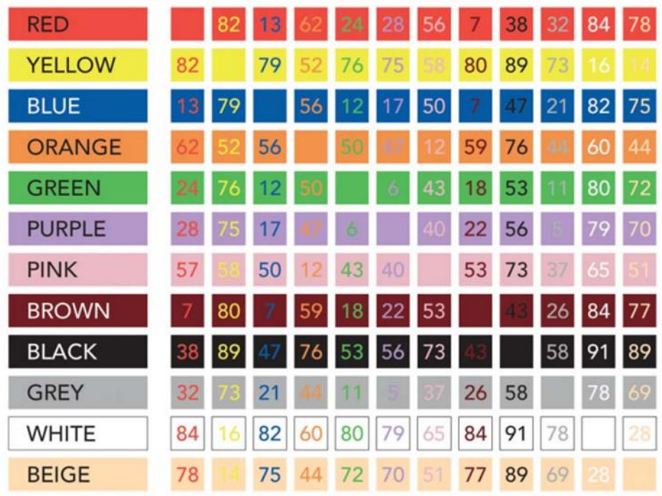
Figure 1 Effect of different colour contrast on legibility

7. Visual considerations include, inter alia , colour contrasts, typography, pictograms, layout, and languages. Figure 1 below demonstrates the importance of sufficient colour contrast in ensuring legibility.