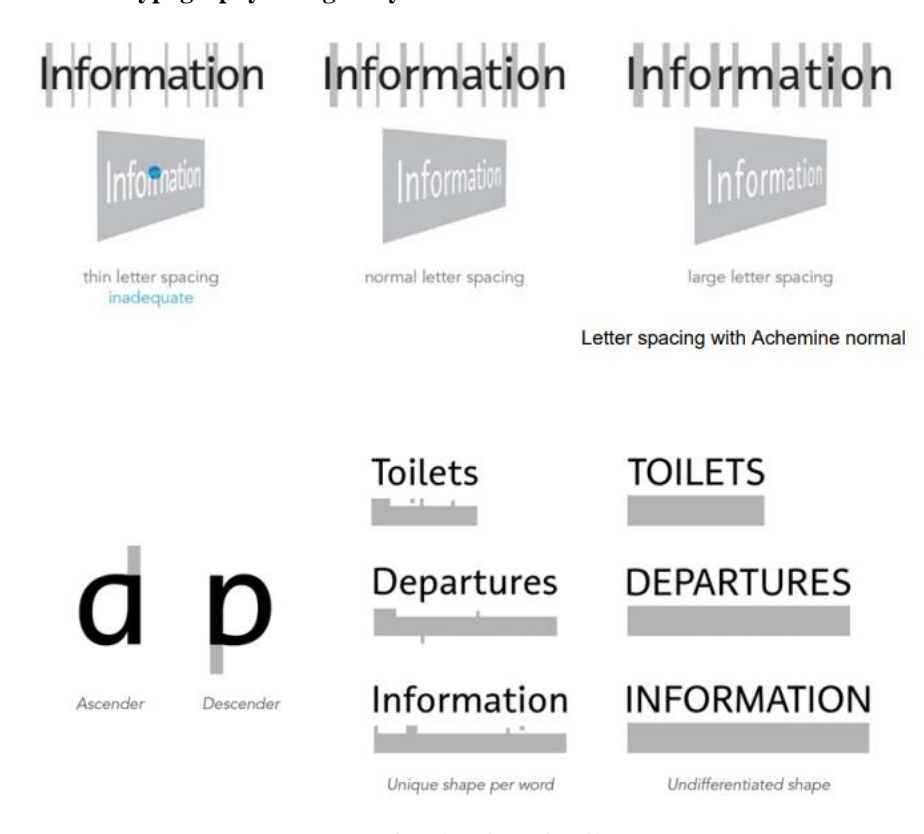
Figure 2 Effect of typography on legibility