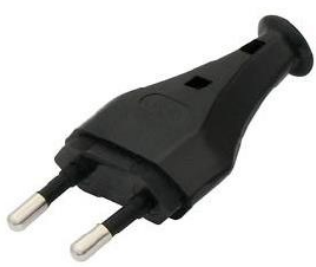
Type C: This will fit