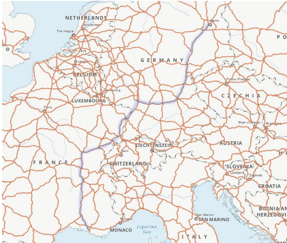
Potential for road to rail shift